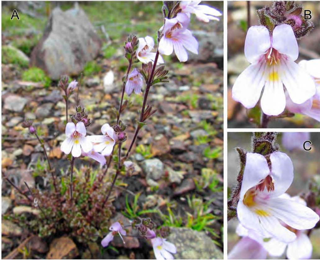
Fig. 1. Euphrasia amplidens . A growth habit; B flower (from front); C flower (part side on).

purple lines on front of lobes, darker behind, becoming darker after anthesis, with mid yellow spot on lower side of mouth and deep in throat at point of insertion of stamens; tube c. 5.0–5.5 mm long, externally glabrous, but for distal extension of hood indumentum and short glandular hairs at separation of lips; hood c. 4.0 mm long, including lobes c. 5–5.5 mm broad, excluding lobes c. 2.5–3 mm broad, externally covered with dense, moderately long (0.2 mm), antrorse eglandular hairs, internally with long fine eglandular hairs at distal end behind upper cleft, otherwise apparently glabrous, the upper lobes facing forward in more or less same plane, erose-truncate or shallowly emarginate, glabrous behind, with cleft between c. 1.7 mm deep; lower lip concave from above, downturned, c. 8 × 9–10 mm, glabrous externally proximal parts covered by sparse to dense short eglandular hairs mixed with scattered short glandular hairs, distally glabrous, the lower lobes shallowly emarginate, with clefts between c. 4 mm deep. Stamens with filaments glabrous, the anterior pair c. 4–4.5 mm long, the posterior c. 3.5–4 mm long; anthers